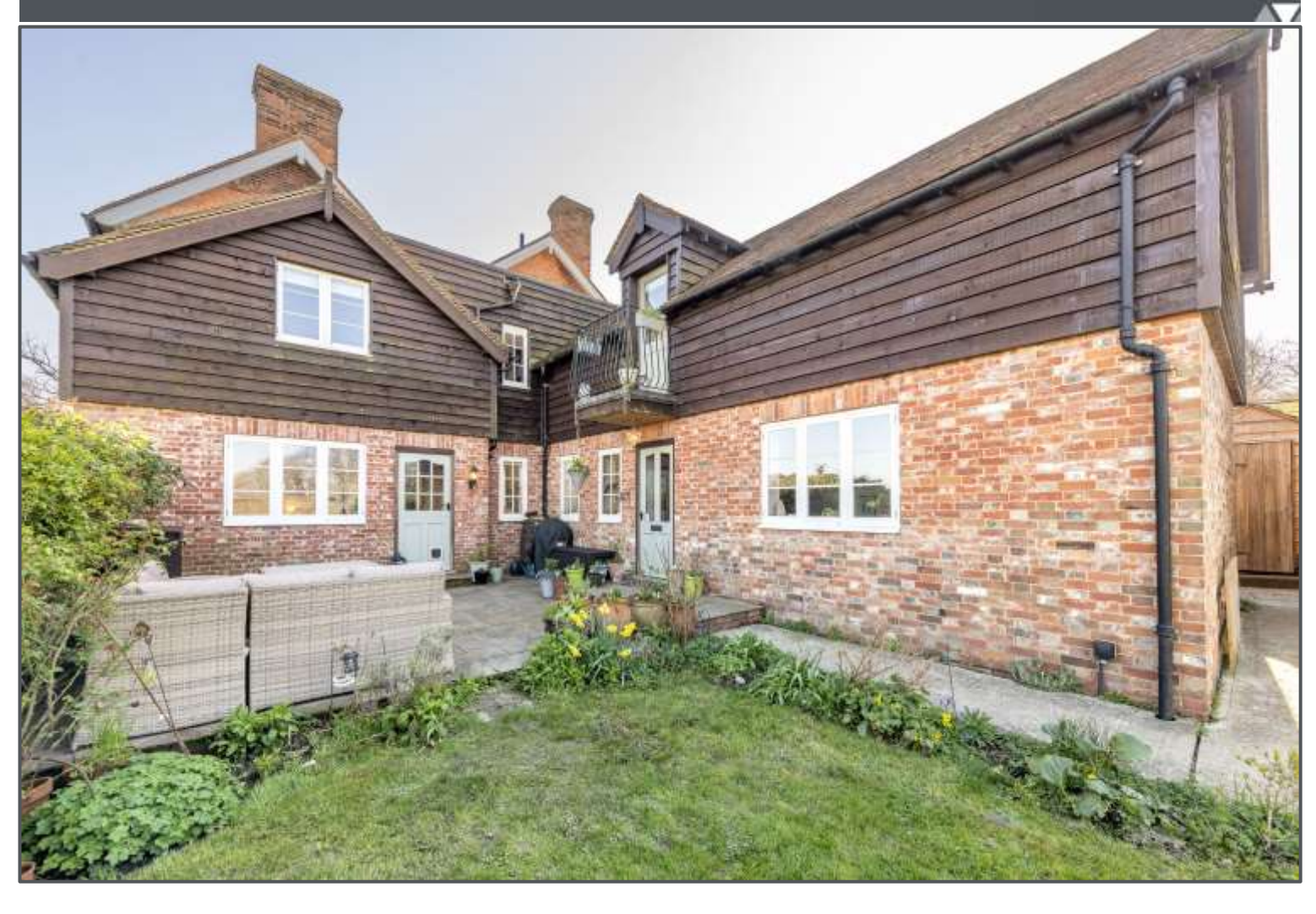
Blackham, Kent, TN3 9UA